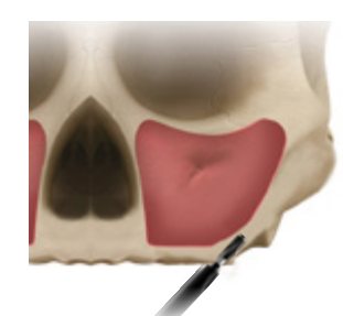
2. Complete the osteotomy with JDPterygo drill Ø 2.8mm at the entrance for 6mm

1. Start the osteotomy using JDPterygo drill Ø 2.0mm at the same implant length to be inserted