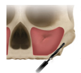
2. Continue using JDPterygo drill Ø 2.4mm at the same implant length to be inserted.

1. Start the osteotomy using JDPterygo drill Ø 2.0mm at the same implant length to be inserted.